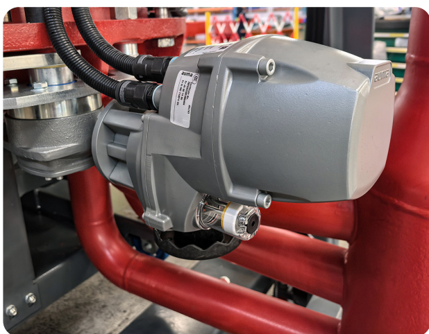
Pfister® AutoGAP 2.1 actuator